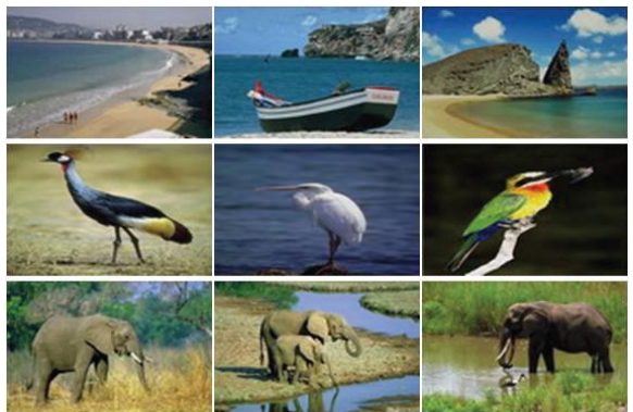
Figure 1: COREL image samples randomly selected from semantic concept beach, bird and elephant. Assessment Metric Discussion

The picture database comprising of 7,700 pictures from COREL picture database. COREL is generally utilized as a part of numerous CBIR works. The greater part of the pictures are from 77 distinct classifications, with 100 pictures for every classification. Pictures in the same class have a place with the same semantic idea, for example, shoreline, fowl, elephant et cetera. That is to say, pictures from the same classification are judged applicable and generally unessential. In Figure 1, we arbitrarily select and demonstrate nine picture tests from three unique classification.